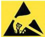
Figure 2 ESD preventive measures

Ra-01SC-P is an electrostatic sensitive device. Therefore, you need to take special precautions when carrying it.