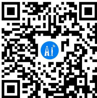
WeChat mini program