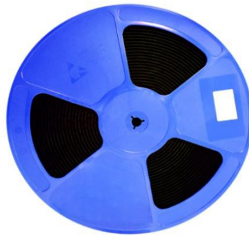
13 Packaging and taping diagram

As shown in the figure below, the packaging of Ra-01SC-P is braided tape, 800pcs/reel. As shown in the figure below: